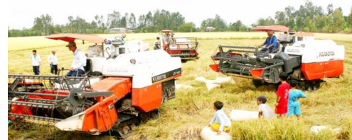
Price of rice increase making farmers exhilarated

So far, farmers in Hau Giang have harvested rice in 20,000ha of the summer-fall crop. 70 percent of rice paddy fields in the province are grown from high quality seeds because they would supply high quality rice for export. This is a positive sign when farmers take heed to high quality seed. Read more