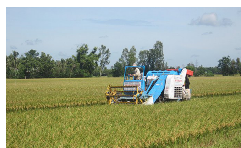
Illusion image

Thailand's benchmark 5-percent broken rice was quoted at $400 to $405 per tonne yesterday compared with $420 to $430 per tonne last week. "Big markets are done with their purchases, and exporters have also stopped buying as the loading is done," said a trader in Bangkok. The arrival of off-season crops from next month and potential new deals also dragged down prices, Chookiat Ophaswongse, the honorary president of the Thai Rice Exporters Association, said. Read more