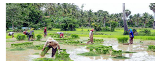
Farmers prepare to plant rice seedlings in Kampot province in 2015.

Cambodia - Cambodian rice exports increased marginally during the first half of the year as export companies push to fulfil higher quotas destined for China. Rice exports totalled 288,562 tonnes in the first six months of the year, an increase of 7.6 percent compared to the same time last year, according to the latest data published by the Secretariat of One Window Service for Rice Export Formality. Exports to China accounted for 94,000 tonnes compared to France's 37,000 tonnes and Poland's 25,000 tonnes. Read more