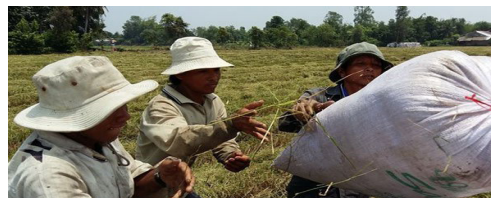
Farmers harvest paddy (unhusked rice) in the Mekong Delta. Vietnam will join a tender to supply 250,000 tons of rice for the Philippines

At a recent conference on rice trade in Can Tho City, VFA chairman Nang said Vietnam might be selected to provide rice for the Philippines as the current rice stocks of Thailand, the major rival of Vietnam, total only 160,000 tons. Read more