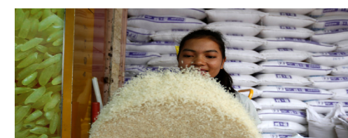
A woman cleans rice for sale in Phnom Penh, Cambodia, July 12, 2017.