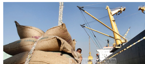
Government data shows a 47 percent rise in the price of coarse rice while a fine variety saw around 20 percent rise in a year. File photo

According to the agreement, Bangladesh will buy 50,000 tonnes of parboiled rice for around Tk 1.95 billion, or $470 a tonne and 200,000 tonnes of white rice for about Tk 7.14 billion at $430 a tonne. Read more